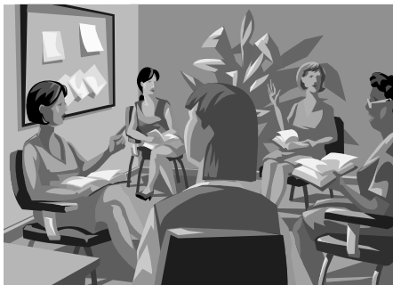
Crossword Puzzle Answers

Exercise For Independent Living Seniors “Keep your chin up,” is not just a saying for senior independent living; this exercise can help in our everyday relaxing time. Sit up straight, lean the head back as far as is comfortable. Uh, oh...didja hear those creaks? Feel the 'pull' in the front neck muscle ? Then lean the head to one side...hold...then the other side...hold. Continue doing this simple exercise a couple times a day, EVERY day. Ease up if soreness develops. Always consult your doctor before starting any exercise program. Information taken from senior.lifetips.com